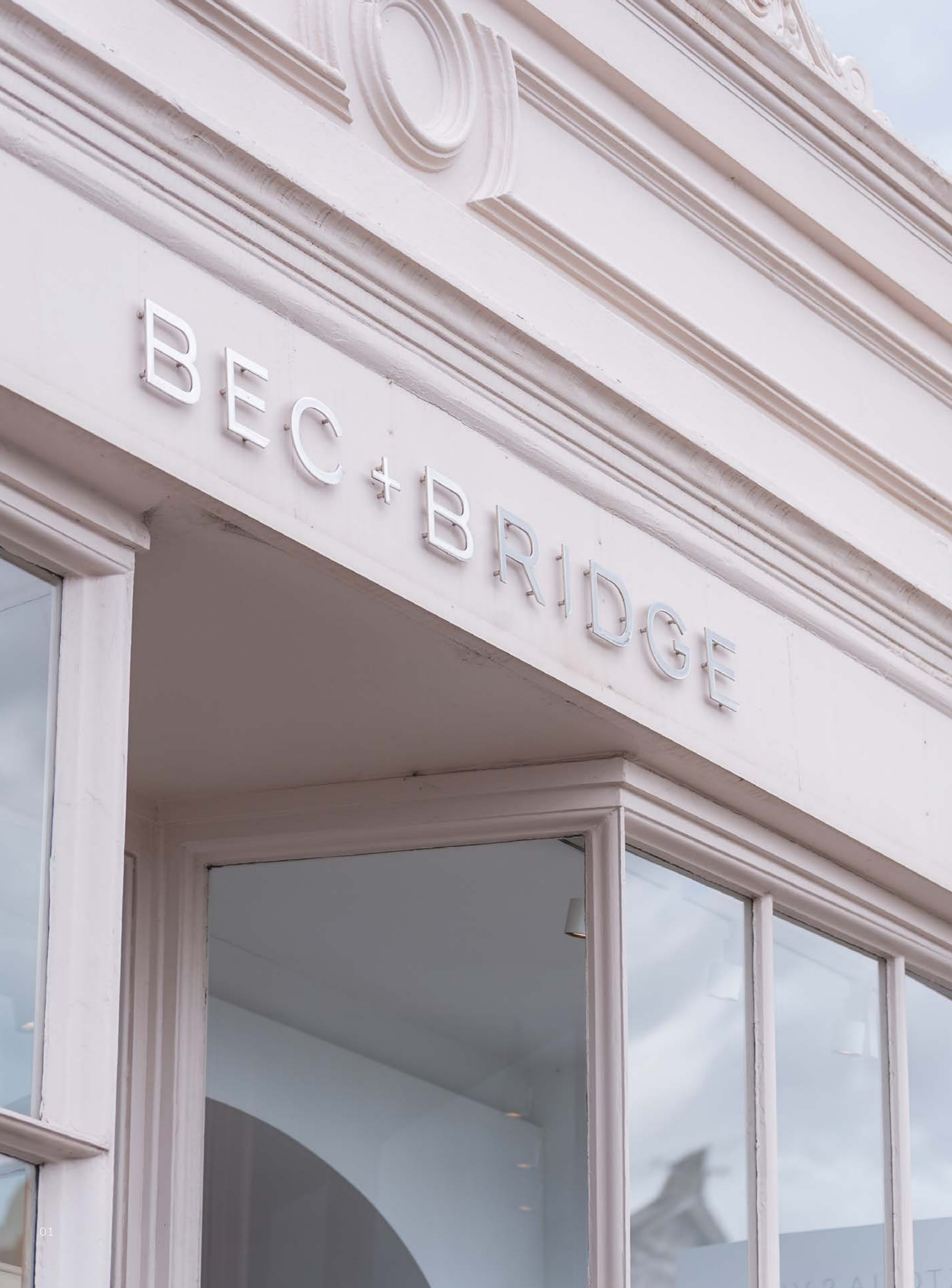
05 Lifestyle A flourishing shopping scene.